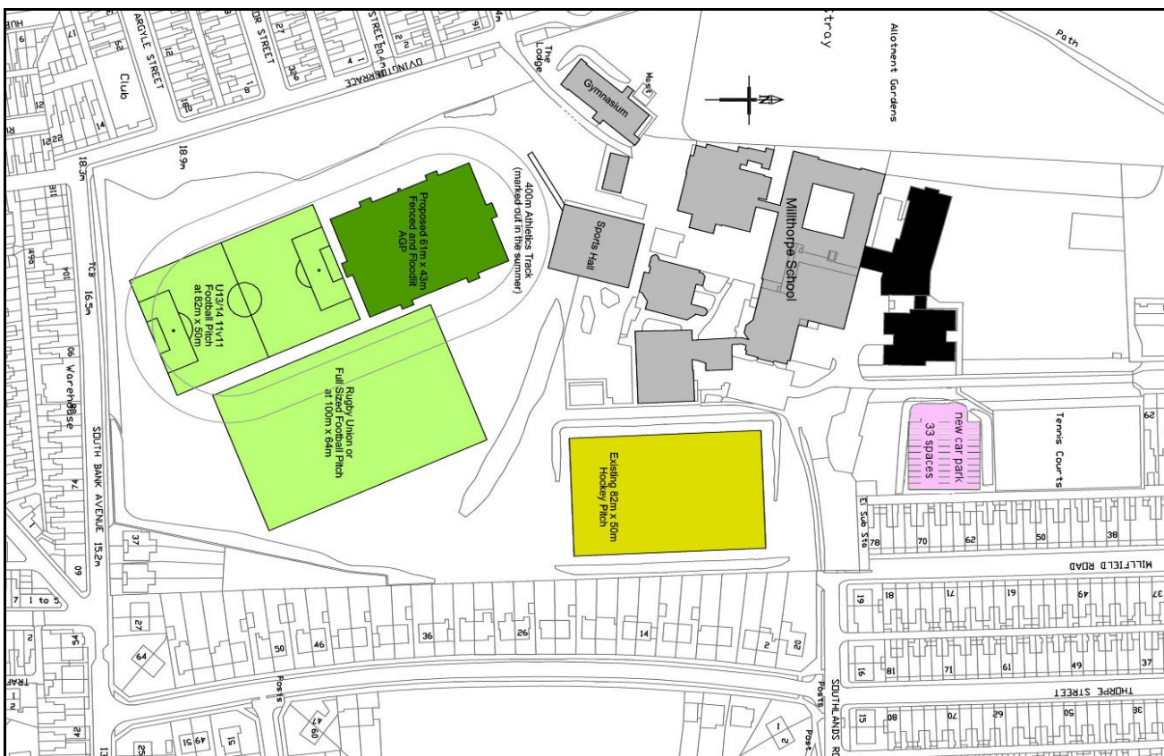
FIGURE 3: Possible new MUGA and car park at Millthorpe school. Note that the size and location of the MUGA are only indicative. The actual size and position have not been decided. The proposed car park has not yet been assessed by LA Highways and Travel planners.